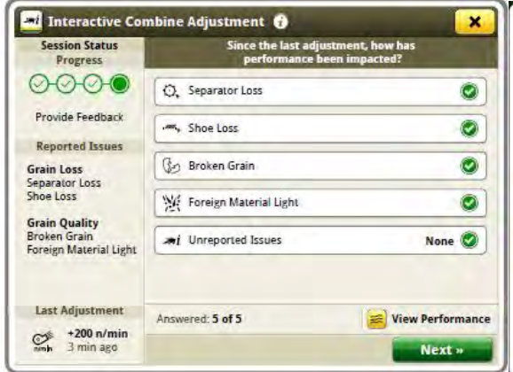
Once the performance has been Corrected, and the ICA session is complete,