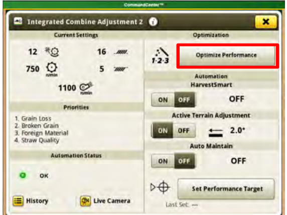
If performance is unacceptable press OPTIMIZE PERFORMANCE