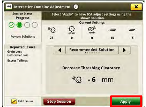
Select APPLY for the system to make changes for each recommended solution.