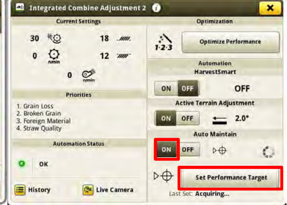
Turn Auto Maintain ON and SET PERFORMANCE TARGET *If HarvestSmart and Auto Maintain are both desired, it is

recommended to turn both systems on and set a target. If one of the systems is running and the other is turned on, a new target will be set for BOTH HarvestSmart and Auto Maintain.