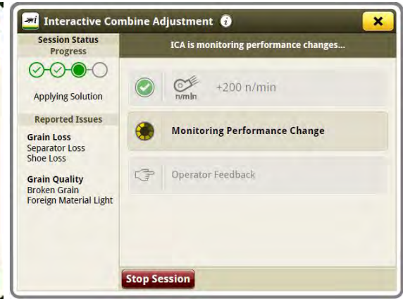
ICA will apply the settings change and begin monitoring the performance change.